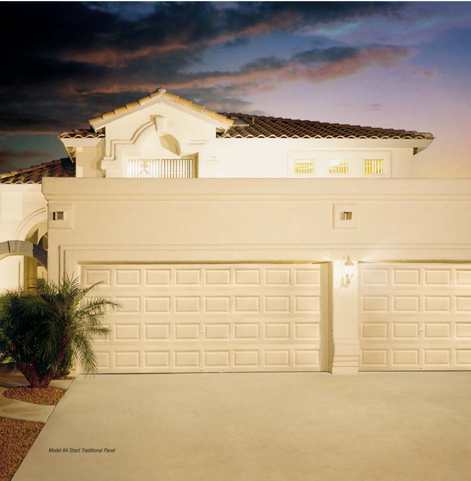
Model 94 Short Traditional Panel