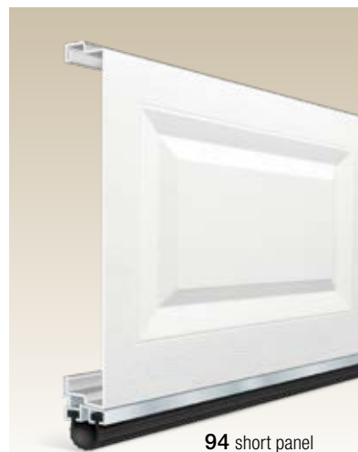
94 short panel